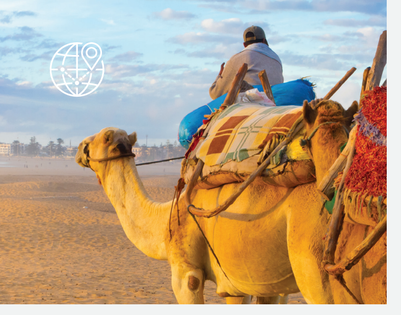
National Trust Travel Plan